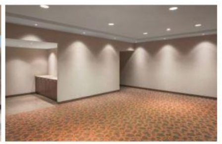
Britannia Foyer South